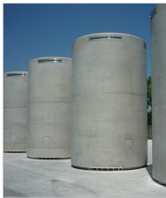
NAC cask systems incorporate unique design, fabrication, and operations features.