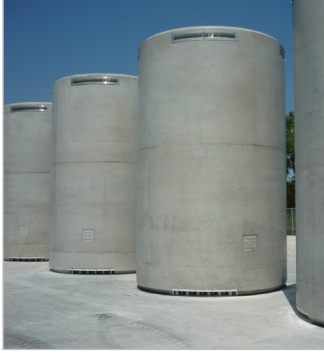
NAC cask systems incorporate unique design, fabrication, and operations features.